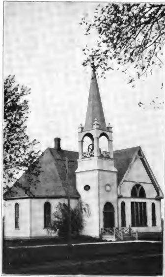
UNITED LUTHERAN CHURCH, THOMPSON